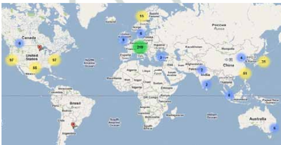
Microfluidic players in world